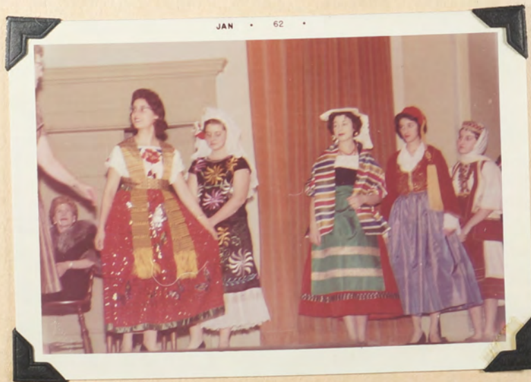
Mexican Mexican Italian, Greek