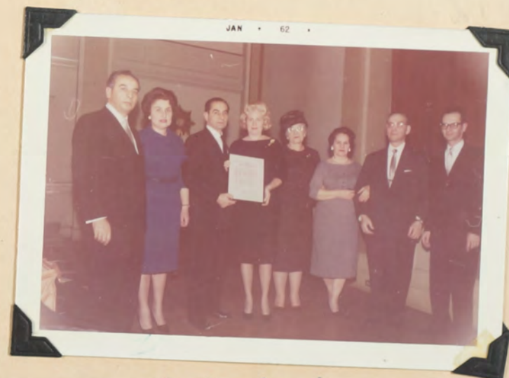
"The Cgavian Family"