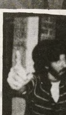
The ghosts of Canchor's past still haunt the office.