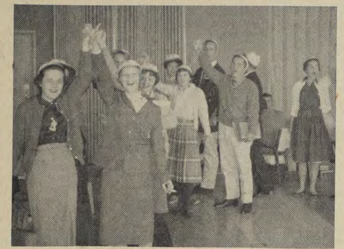
Freshmen sing, "The Juniors want us two by two!"