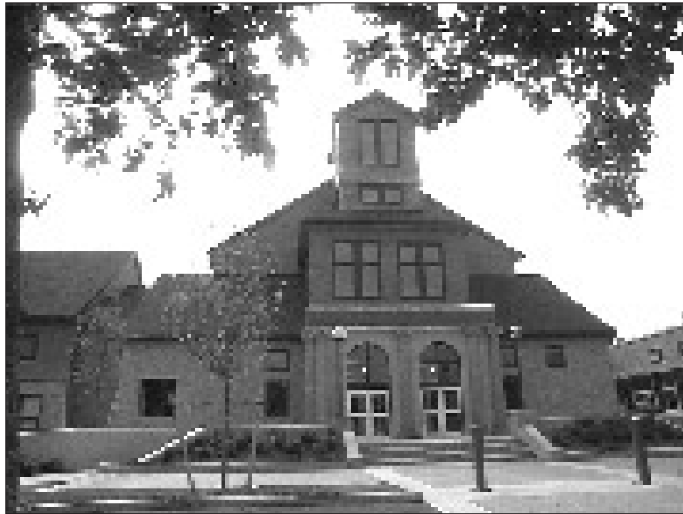
COMPLETED CONSTRUCTION: The John Nazarian Center for the Performing Arts will be officially dedicated on Friday, Sept. 15.

It was designed to provide appropriate teaching and learning spaces for faculty and students at the College, as well as high quality performance spaces for student and professional productions, thereby expanding cultural opportunities for