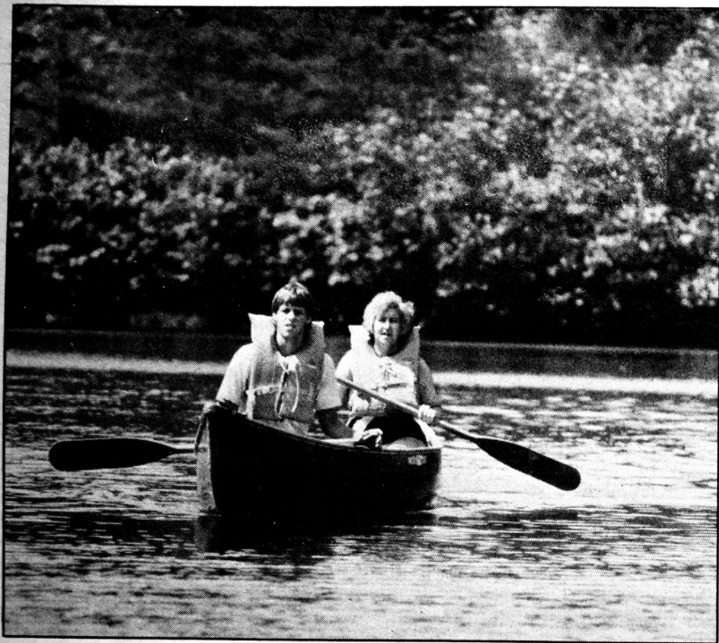
Canoeing at Camp Rediscovery is fun for all ages with particular emphasis on the senior camper.

U.S. Senate Special Committee on Aging, G-41 Dirksen Senate Office Building, Washington, D.C. 20510, Attn: "Home Care at the Crossroads".