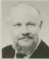
JOHN NOBLE WILFORD

John Noble Wilford, noted journalist and Pulitzer Prize winner, whose work is recognized and respected by historians, anthropologists, geographers, and other scientists, is a prolific author whose books and articles are enjoyed by the casual reader as well. His work challenges the imagination by spanning both space and time, i.e., The Mapmakers: The Story of the Great Pioneers of Cartography from Antiquity to the Space Age , and The Riddle of the Dinosaur , to We Reach the Moon and Spaceliner . We Reach the Moon , published in 1969, is the story of the Apollo Project and has been translated into German, Italian, Japanese, and other languages. Spaceliner , published in 1981, is the story of the space shuttle project.