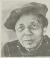
MARGARET T. BURROUGHS

Artist, educator, museum director, author, and poet, Margaret Burroughs is an inspiration to all those around her. She is dedicated to the creative arts, international culture, and specifically to African and African-American life, history, and tradition. Her concern for others is evident in her recent activities as a volunteer teacher in prisons and penitentiaries throughout Illinois. And her untiring dedication to youth is exemplified by her service to her own South Side Chicago community.