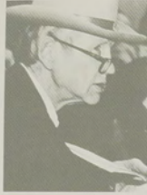
JUSTIN DART, JR.