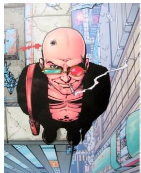
<u>Transmetropolitan: Lust for Life</u> by Warren Elliis and Derick Robertson (Vertigo, 1998), Cover.

Graphic novels can be described as novel-length comic books of adult interest. Many have received critical notice. The art work is sophisticated, brilliant, frequently frightening, and psychologically disturbing. At their best these novels challenge basic assumptions of decency, honesty, and truth and civilized beliefs in order, justice, and continuity. They question easily held opinions on mental health and the spiritual. In 2006 the Journal of Academic Librarianship published an article, "Graphic Novels in Academic Libraries: from Maus to Manga¹" that legitimized the collection of graphic novels in major research libraries.