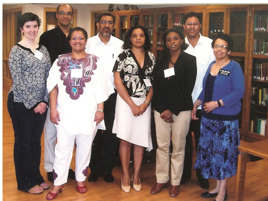
Shown at right with Cape Verdean Scholars