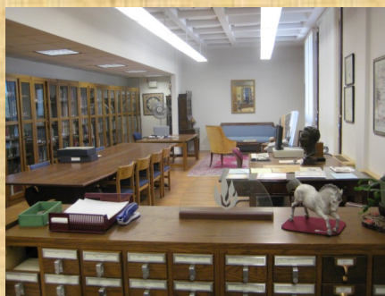
Special Collections Reading Area, Level 4