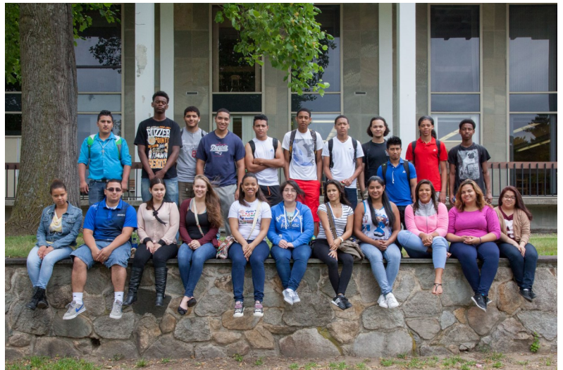
Central Falls juniors pose for a photo in front of the Adams Library during their campus visit.

Their answers demonstrate that our student employees are not only aware of the Library's collections and services, but also that they can help librarians to prioritize orientation sessions and to keep them fresh and relatable.