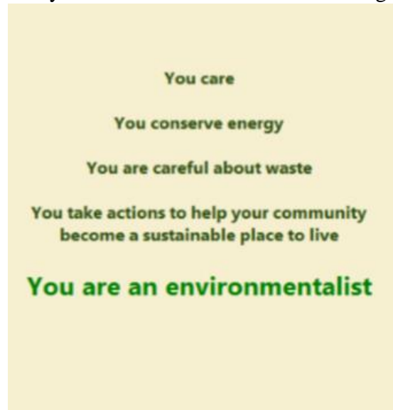
Many Behaviors Condition Label Message