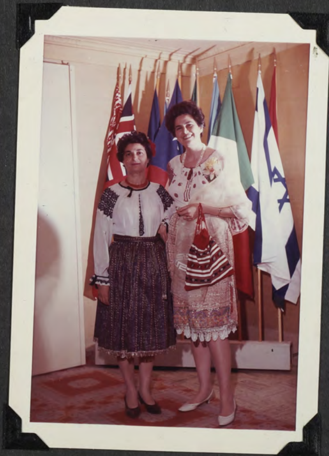
Guests in nationality costume