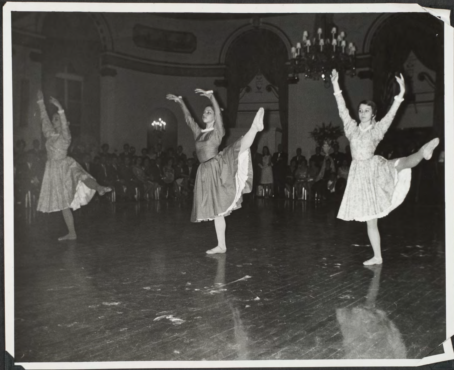
New England Settlers Dance