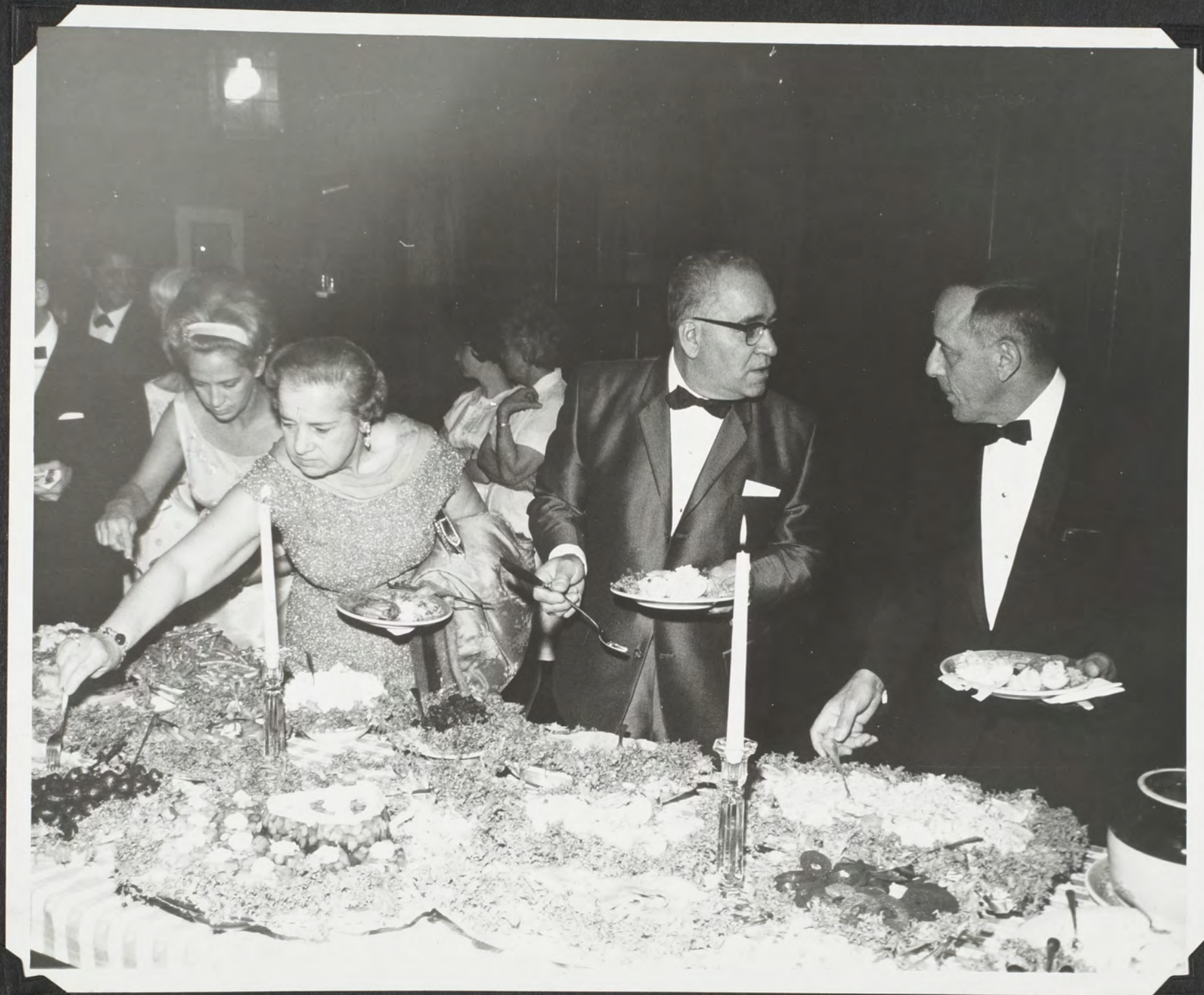
Buffet Supper at the Providence Art Club