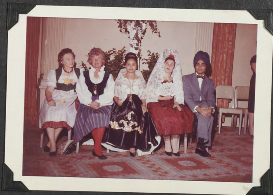
Guests in nationality costume