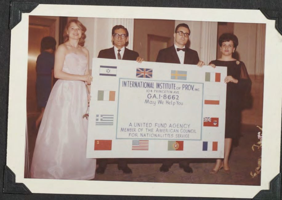
Our new sign