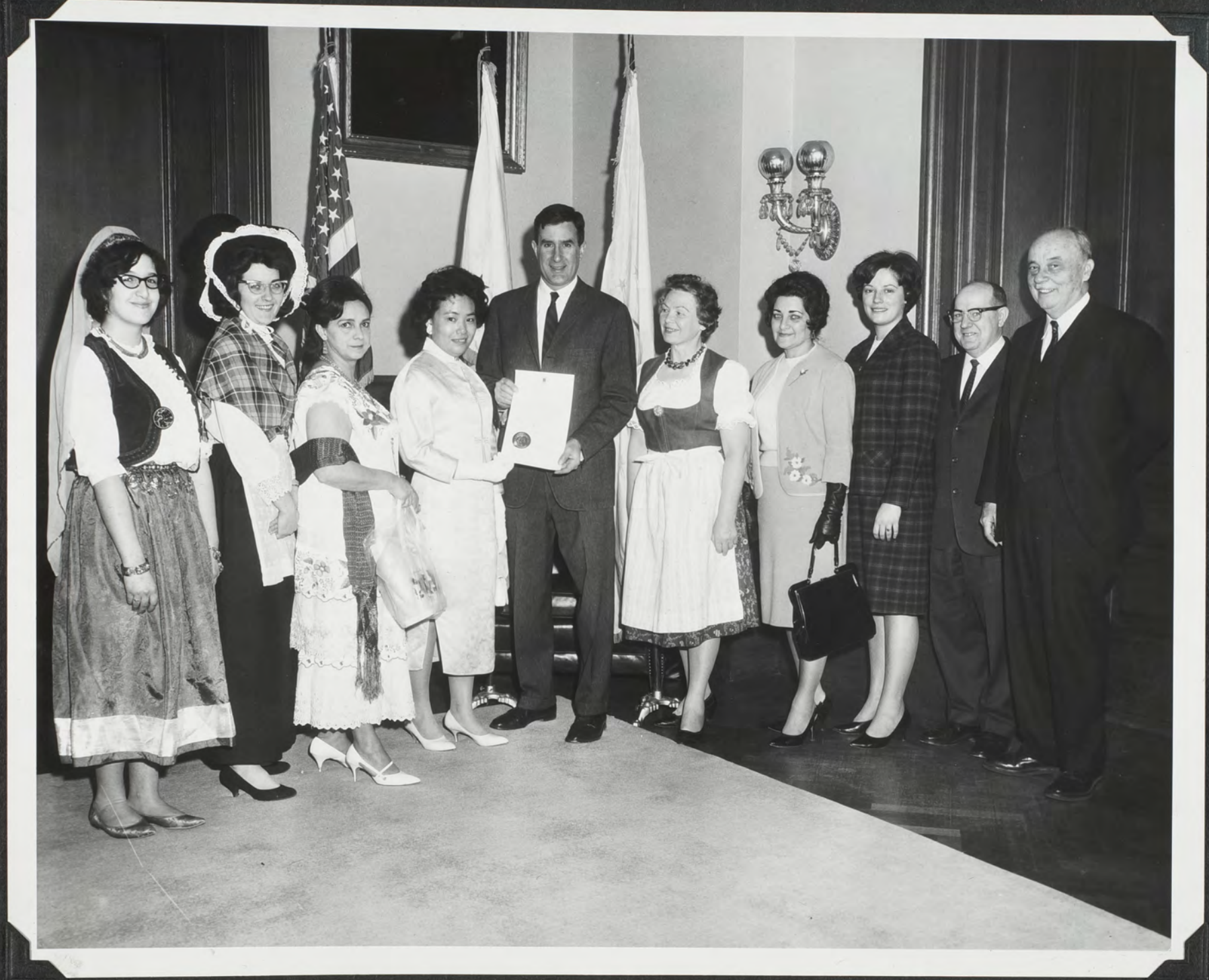
International Week Proclamation from Governor Chafee