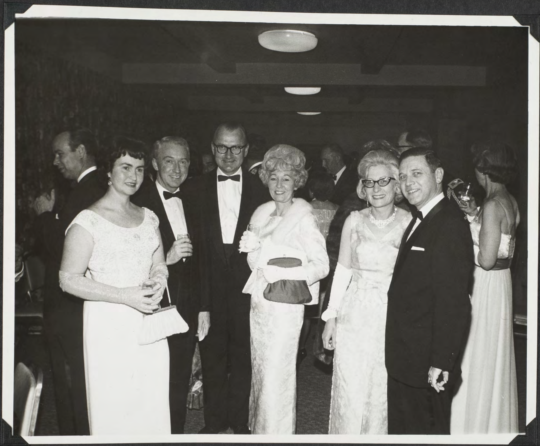
Special Guests in State Suite