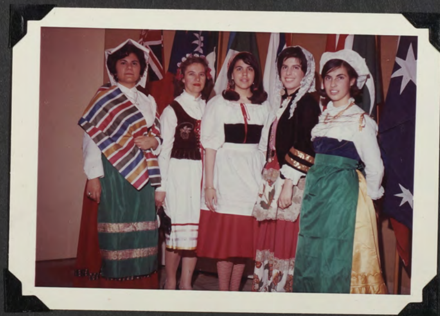
Flower girls in nationality costume