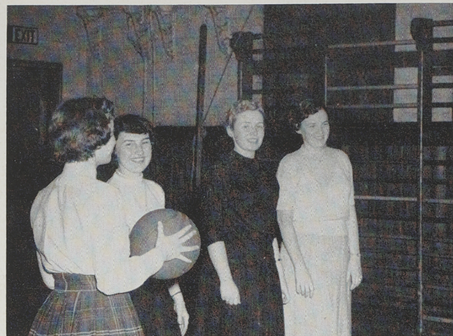
W.A.A. enthusiasts are still wondering about the recent upset. (See story — W.A.A.)

That's the story of the school buses which might be named Bedlam. Young America on wheels, singing, yelling, and vigorously alive. Earplugs, anyone?