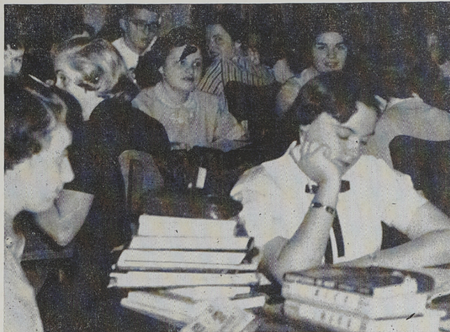
Even with the crowded conditions in the library, our librarians have worked hard to make it equal to or better than libraries of other colleges. (See Letter to Editor).

The eternal triangle: Income, Outgo, Deficit.