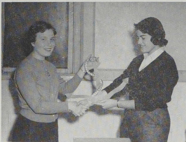
ANCHOR editorship changes hands

Student council and classes will soon be concerned with the election of representatives to the Eastern States Conference to be held in New York on March 22, 23 and 24.