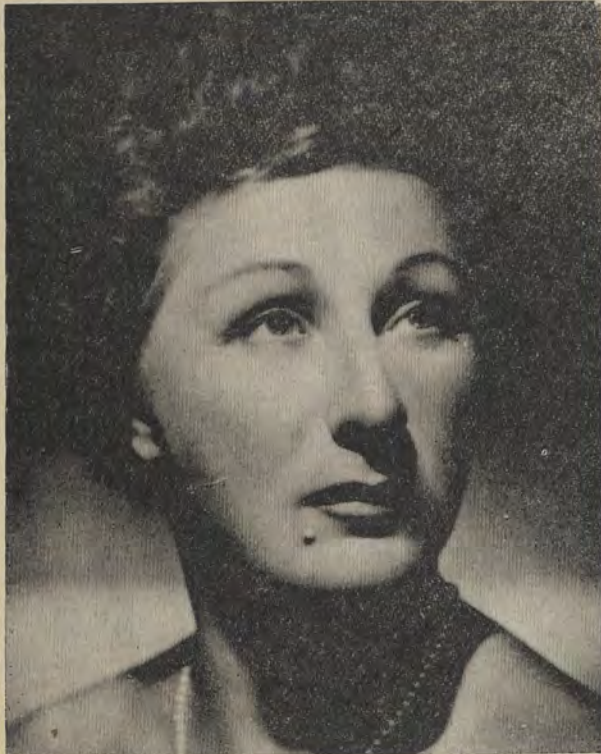
Dame Judith Anderson

Tickets have been available at the Roberts Hall box office since September 30. Students may obtain their tickets upon presentation of their 1964-1965 ID card. Prices for faculty tickets have been set at $1.00 for the first two, and tickets for the public will be sold for $1.50. The box office will be open until October 6 from 11:30 A.M. to 12:50 P.M. and from 3:00 P.M. to 5:00 P.M. each day. On October 6, the day of the performance, the box office will be open until the time of performance.