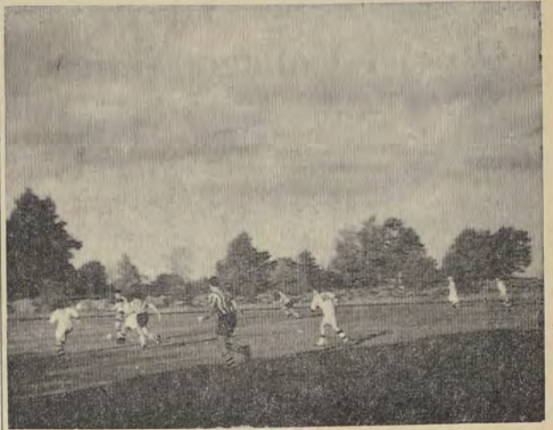
Anchormen appear outnumbered in run for soccer ball in the Willimantic game.

The Anchormen held the visitors to two goals throughout the first half. The game looked as if it would be close; but the Willimantic team could not be held. Halfway through the third quarter, Willimantic got goal number 3 and from then on there was no stopping them. The strong offensive attack employed by the visitors kept RIC within their own half of the field throughout most of the game. The Anchormen had no more than a half-dozen shots at the opposing goal.