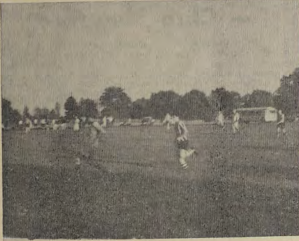
Anchorman chases ball to sideline in game with Willimantic. RIC lost the game 7-0.