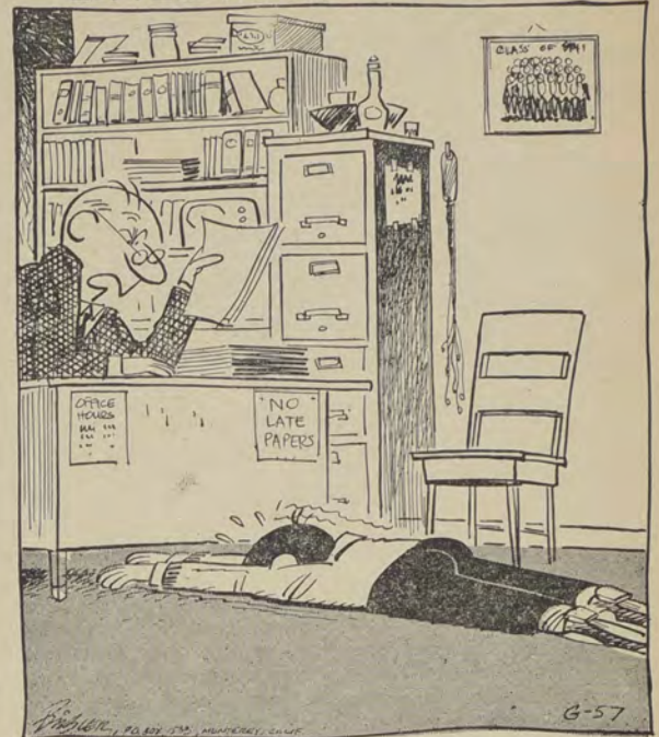
"I TAKE IT THAT PASSING THIS COURSE IS VERY IMPORTANT TO YOU."