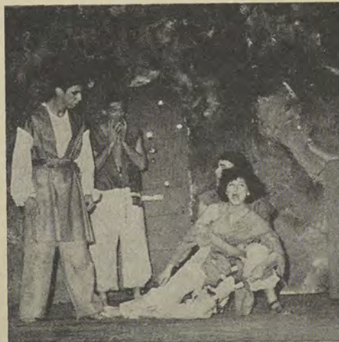
"I'm A Mess"