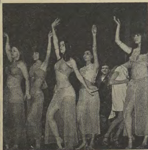
Cleopatra's Dancers Do What They Do Best.