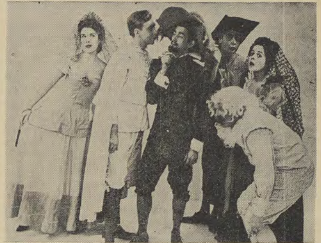
Turnau Opera Players