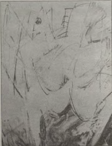
UNTITLED 1999, oil on canvass, 40" x 48" by Peter Forsstrom (sic).

In conjunction with the exhibition, works by faculty, alumni,