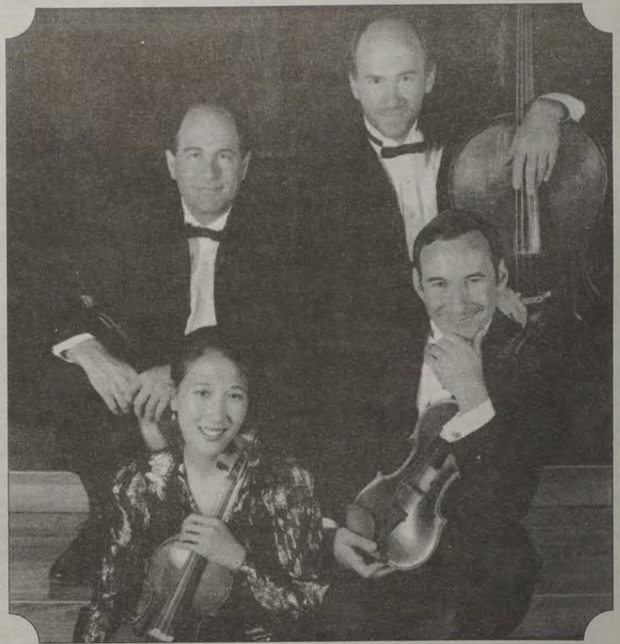
MUIR STRING QUARTET will perform Mozart's Quartet in D Major, K. 575; Berg's Quartet, Opus 3, and Grieg's Quartet in G minor, Opus 27 in the President's Music Series at Rhode Island College's Gage Hall auditorium at 8 p.m. Monday, Feb. 7. This is the quartet's third and last appearance in the series this year. Tickets are $19; $17 for senior citizens and $14 for students and may be purchased in advance via Visa or MasterCard by calling 401-456-8194 from 10-4 daily or in person at the Roberts box office.

Hours for the gallery, which is located in the RIC Art Center, are Tuesday through Saturday from 11 a.m. to 4 p.m. and Tuesday and Thursday evenings from 6 to 9.