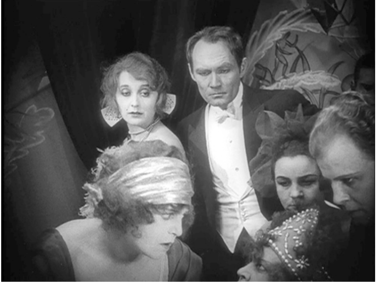
Fig. 13 – Countess Told, Dr. Mabuse, the Gambler