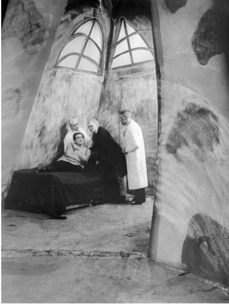
Fig. 7 – Asylum, The Cabinet of Dr. Caligari