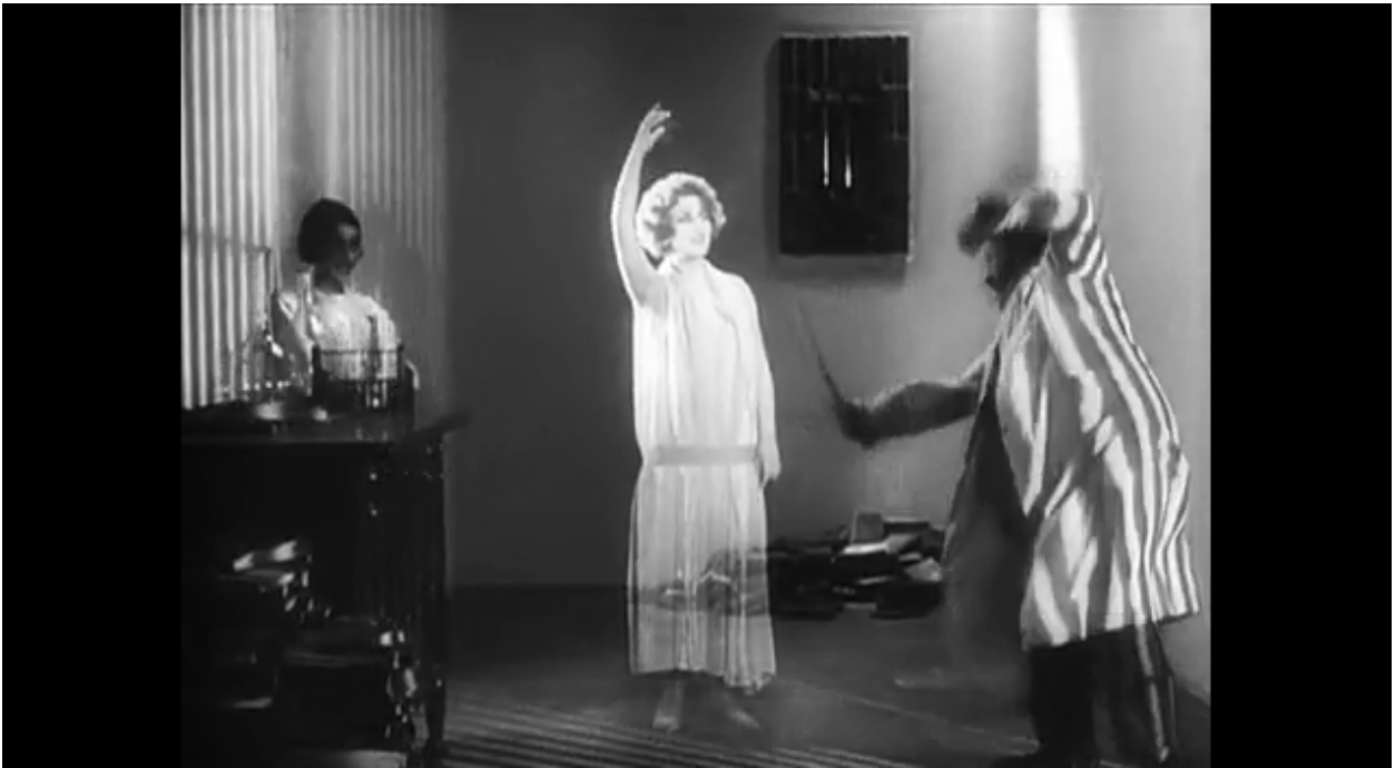
Fig. 4 – Martin stabs wife, Secrets of a Soul