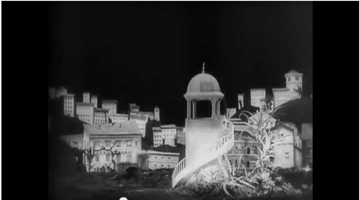
Fig. 2 – Tower in Secrets of a Soul