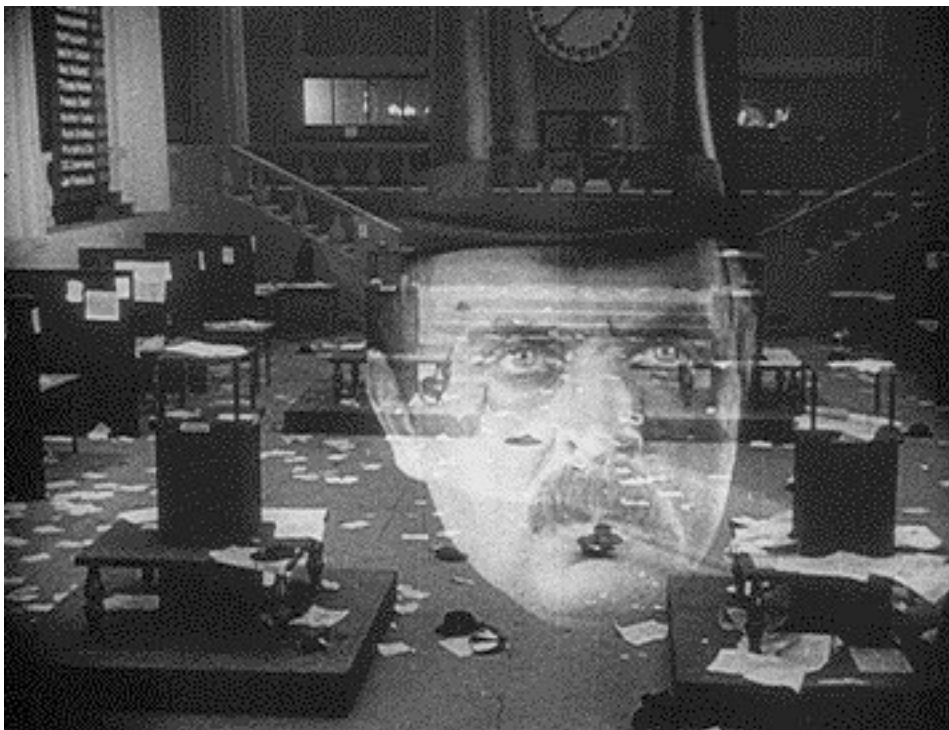
Fig. 9 – Stock Market Takeover, Dr. Mabuse, the Gambler