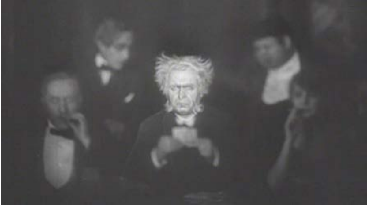
Fig. 12 – Displacement (staged screen right), Dr. Mabuse, the Gambler