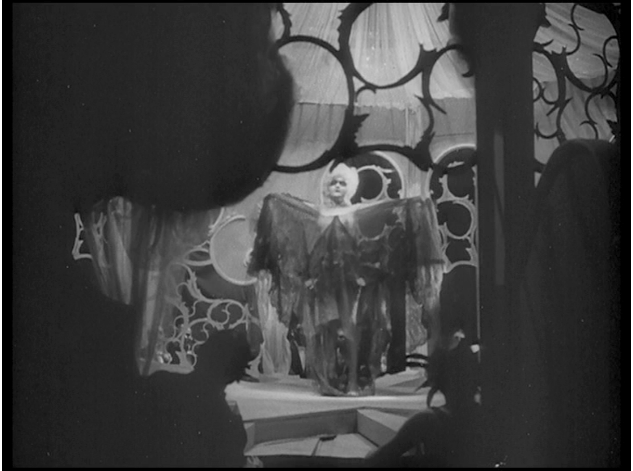
Fig. 10 – Petit Casino, Dr. Mabuse, the Gambler