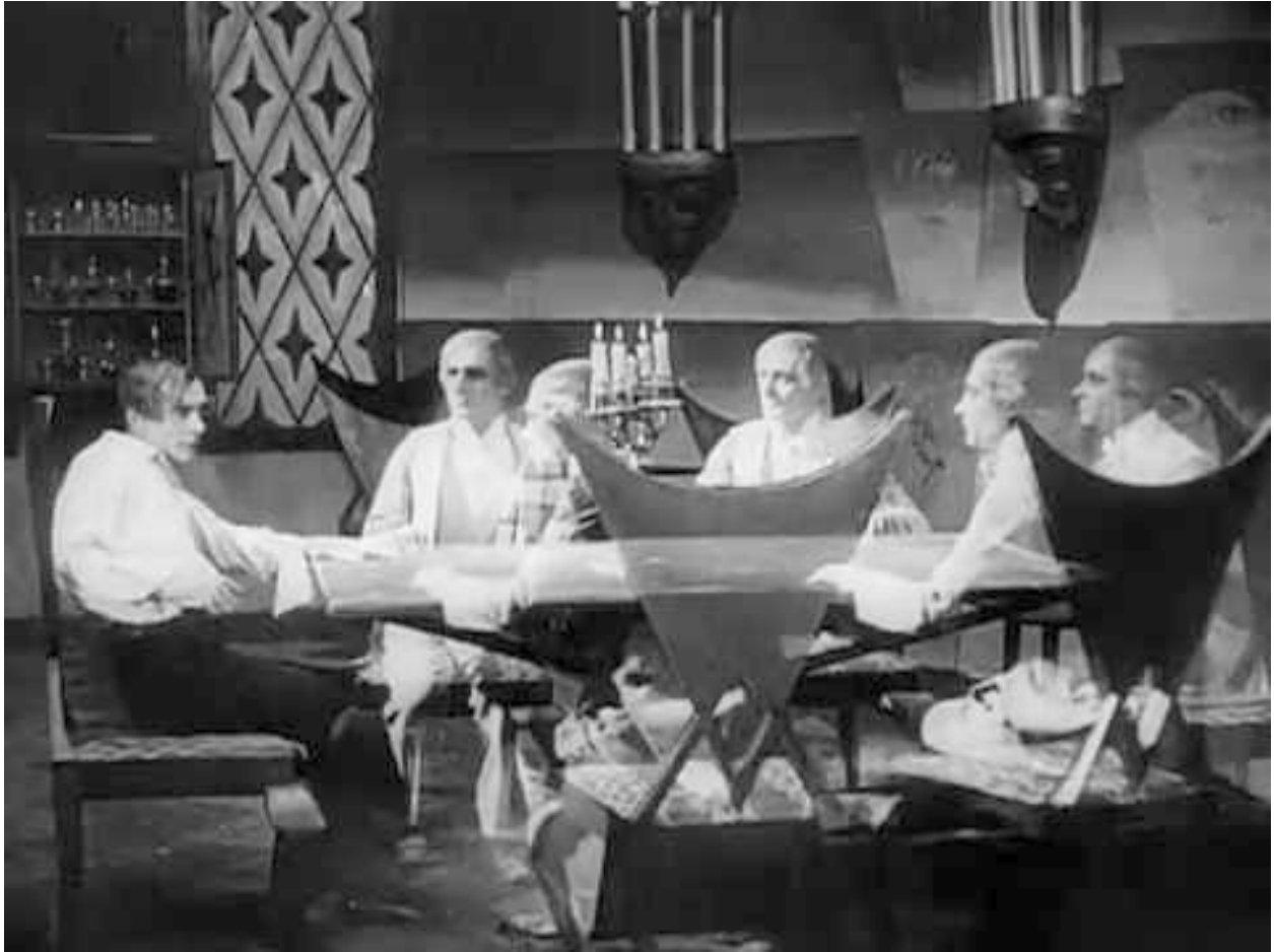
Fig. 11 – Fever Dream, Dr. Mabuse, the Gambler