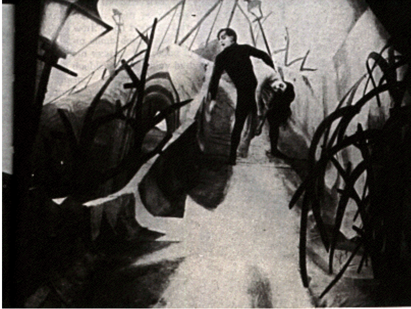
Fig. 1 – Expressionist mise-en-scene, from The Cabinet of Dr. Caligari